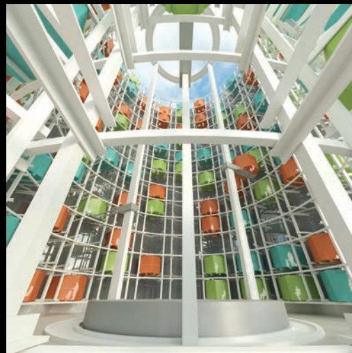
The framework allows for growth and reaction to the needs of the surrounding community.