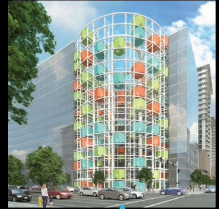
The Integrative Health Hub is a system that elevates care through technology and thoughtful design.