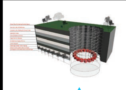
The stacking of the Integrative Health Hub brings together patient services to provide holistic care.