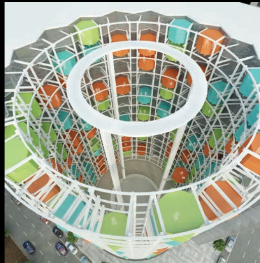
Renderings of the Integrative Health Hub provide a conceptual view of the pod distribution and inner workings of the delivery system.