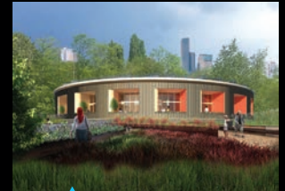
Solution: even the vulnerable have access to care that respects their physical, mental and social needs.