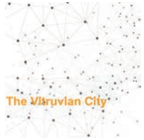
The Vitruvian City