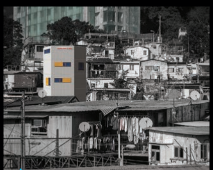
Kowloon "Integrated community clinic"