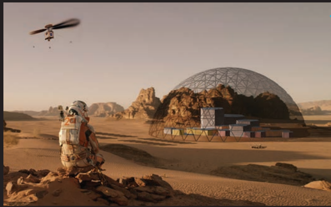
On Mars "and beyond." Photo credit from the motion picture "The Martian."