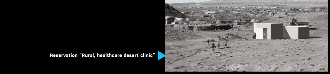
Reservation "Rural, healthcare desert clinic"