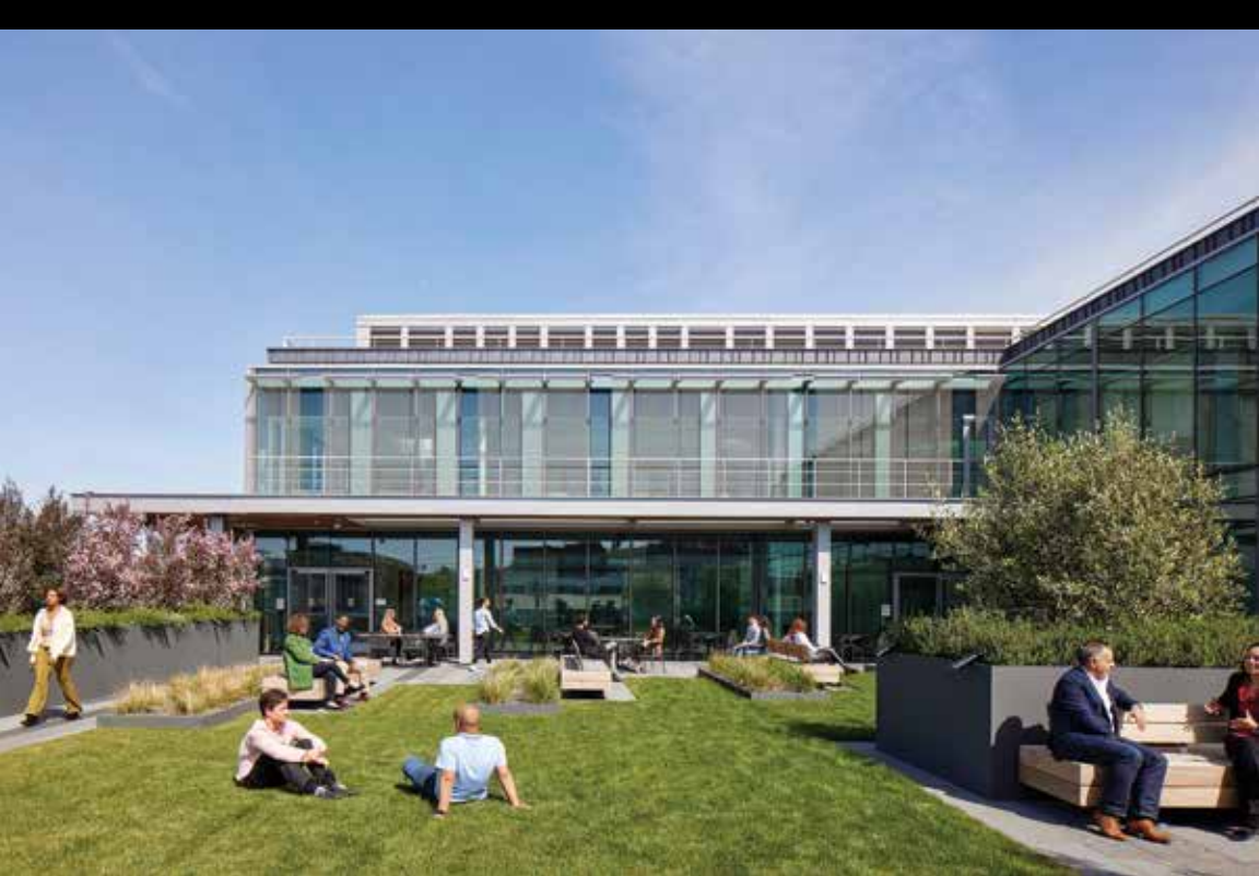
2023 Award of Merit Winner: The University of California, San Francisco, Nancy Friend Pritzker Psychiatry Building. Submitted by: ZGF (Portland, Ore.).